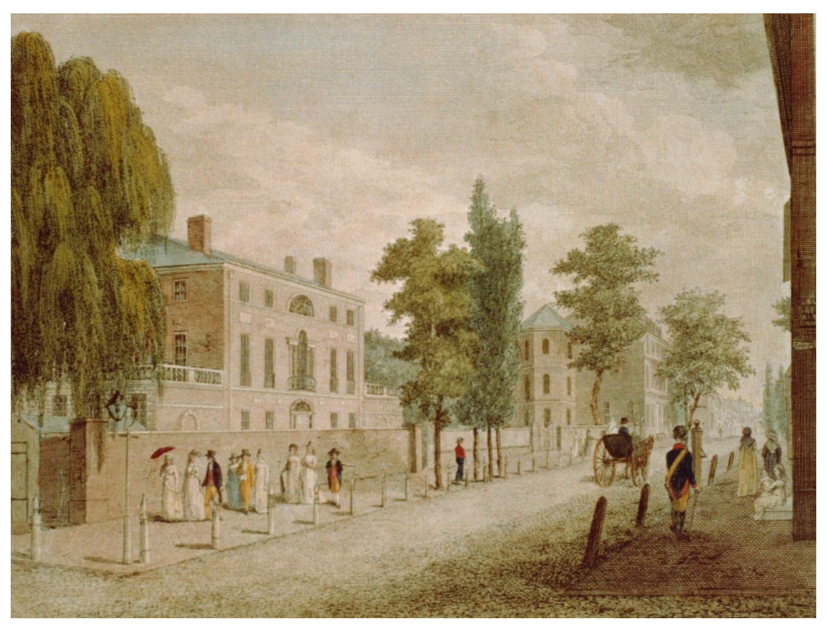
CORNER OF THIRD AND SPRUCE STREETS, PHILADELPHIA, 1800